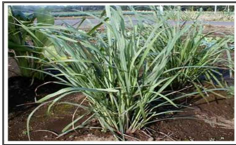
Figure No.3: Exomorphic feature of Lemongrass 13